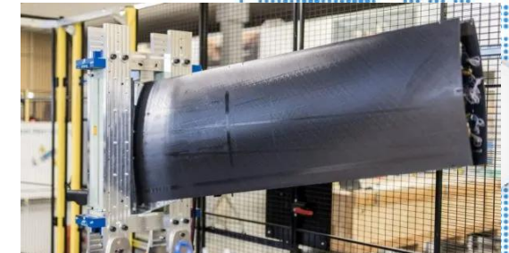
Daher – Shap'In