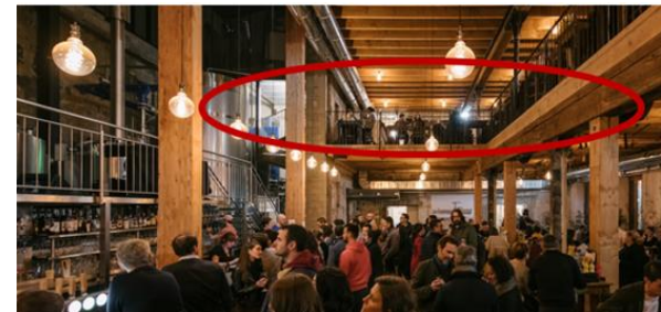
Little Atlantic Brewery